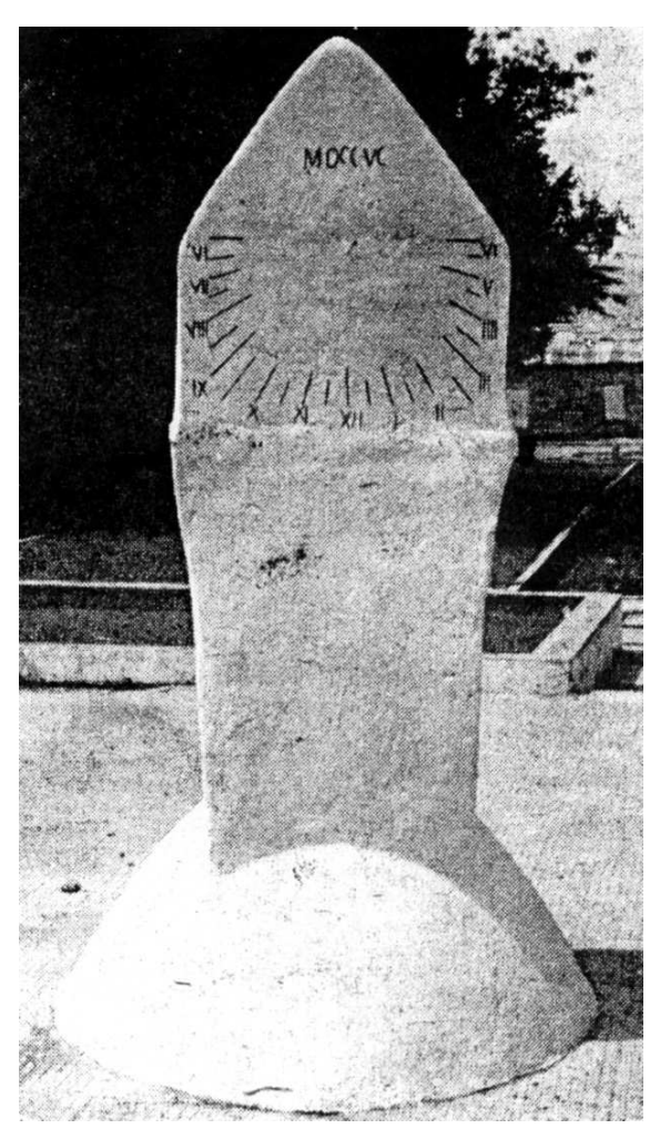
Figure 3 Pillar Dial in Bianca, Dominican Republic. Erected 1795.

In 1795 a vertical pillar sundial was installed in Banica, a Dominican borderline town near Haiti. [5] Figure 3 is a photograph from Palm's book, clearly showing the dial's date "1795" in Roman numerals.