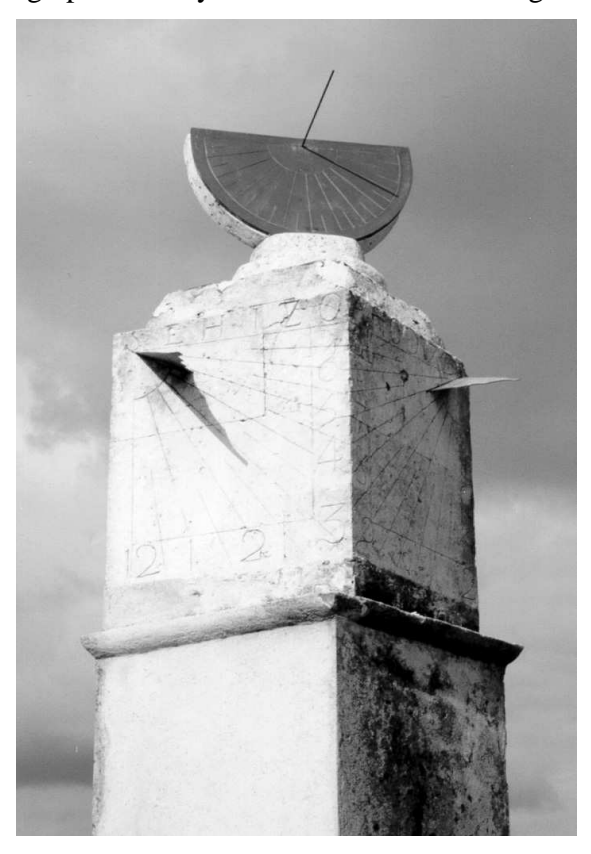
Figure 2 Santo Domingo Pillar Sundial, Erected ~1753and Restored 1992

During the administration of Francisco Rubio y Pernaranda, in 1753 a massive cube with vertical dials was erected on a tall pillar in front of the Governor's Palace, today called the Museo de Casas Reales in the historic Colonial Zone of Santo Domingo. By the end of the century, probably in 1787, an equatorial dial was mounted on top of the pillar dial, but was broken off by a hurricane. In 1992, as part of the Fifth Centennial Discovery activities, the equatorial dial was reinstalled. A recent photograph taken by the author is shown in Figure 2: